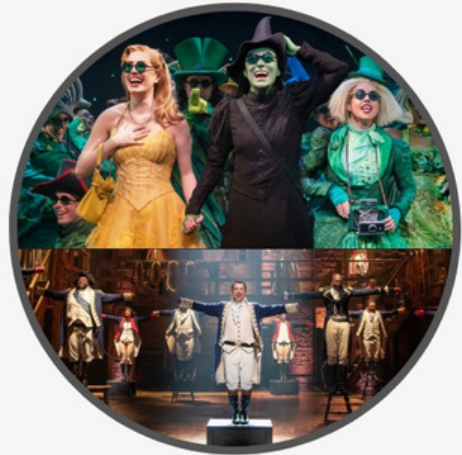
BROADWAY TICKETS TO ANY SHOW!