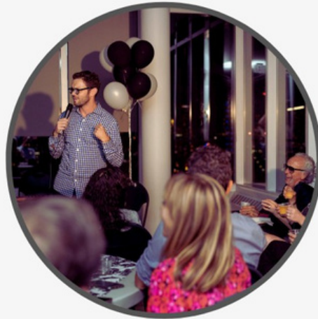
PRIVATE COMEDY SHOW