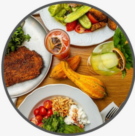
AMAZING RESTAURANT DEALS