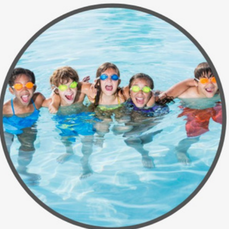
KID ACTIVITIES FROM SWIM, DANCE, FENCING AND MORE!