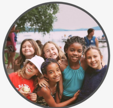
AWESOME CAMP SAVINGS FROM 92Y, STEVE & KATE, KING, CAMP SETTOGA, ETC.